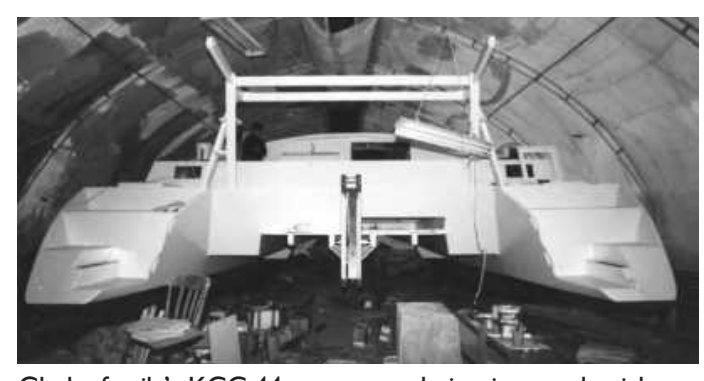
Glasby family's KCC 44 nears completion in a garden igloo

Precut kits, construction and delivery can be arranged.